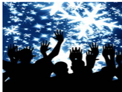
Healing Team Members Meet @ 5p.m.